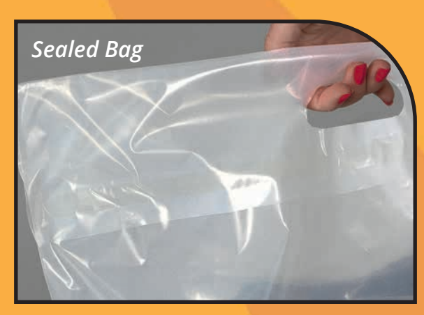
See instructional video on our website.